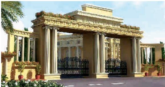
Main Entrance Gate