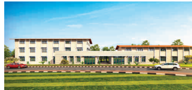
Cafeteria & Workshop