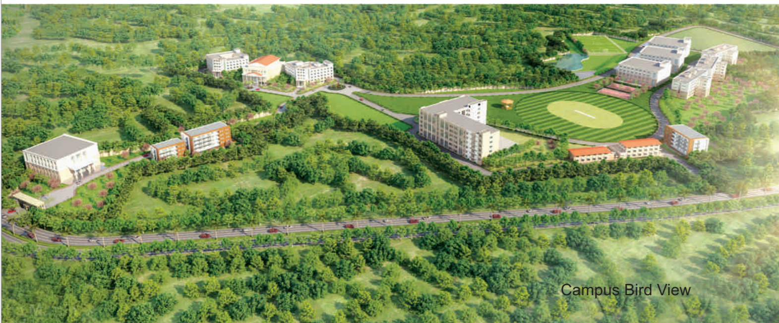
Campus Bird View