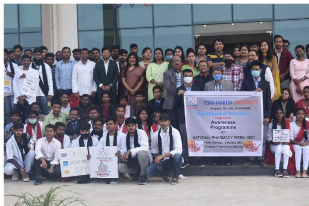
UMU team celebrating the National Pharmacy Week

A nukkad natak on the topic 'Awareness on Dengue and Malaria' was staged at village Angara on the 19th of November 2021 as part of the National pharmacy week celebrations. The motive of the nukkad natak was to spread awareness among the citizens about dengue and malaria.