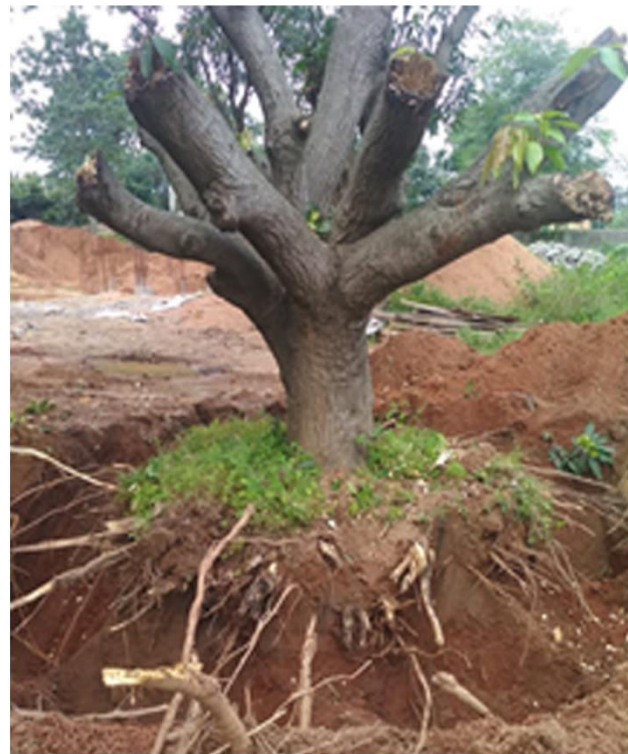
A mango tree being translocated in the campus