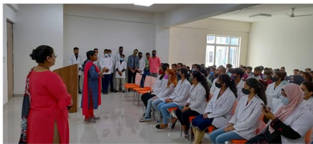
Participants at the blood donation workshop

A blood donation camp followed the blood donation awareness workshop. It was organized by the Health Club of Usha Martin University in collaboration with Sadar Hospital, Ranchi and Life Savers Group on 8th October.