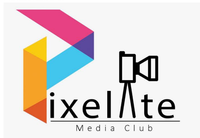
Logo of the Pixelate - Media Club