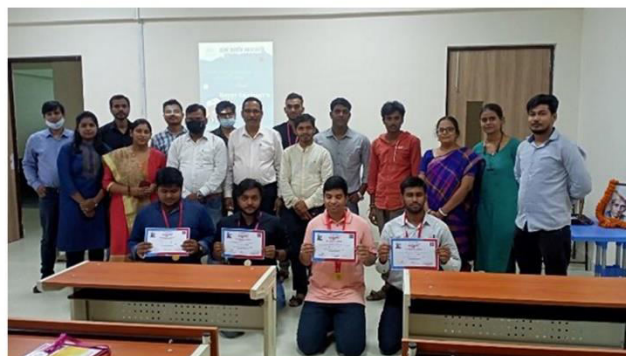
Faculty members and students at the event