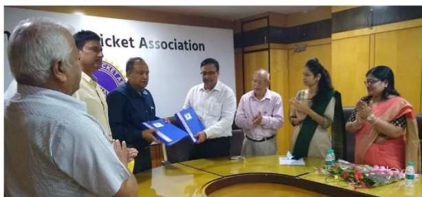
MoU being signed between JSCA and UMU