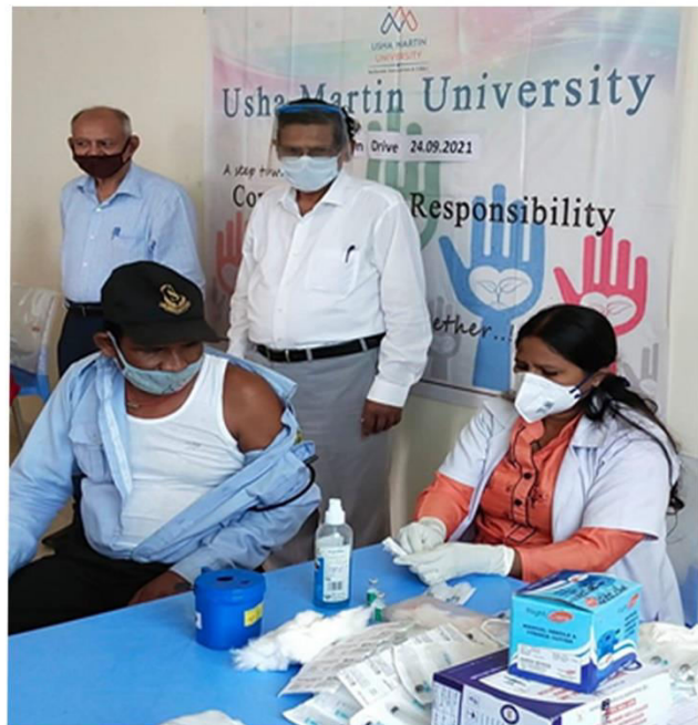
Participants at the blood donation workshop

COVID-19 has shattered the confidence of people due to the high mortality rate. To create a sense of confidence among the masses a COVID-19 vaccination camp was organized in the University campus in collaboration with Sadar Hospital, Ranchi.