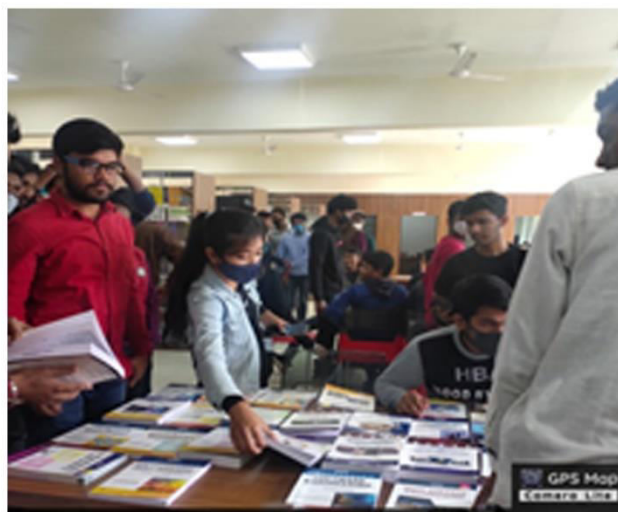
Students at the book exhibition

Two book exhibitions were organized in the University library. New Age International Publications, New Delhi participated in the exhibitions. The exhibitions were held on 30th September and 23rd November respectively.