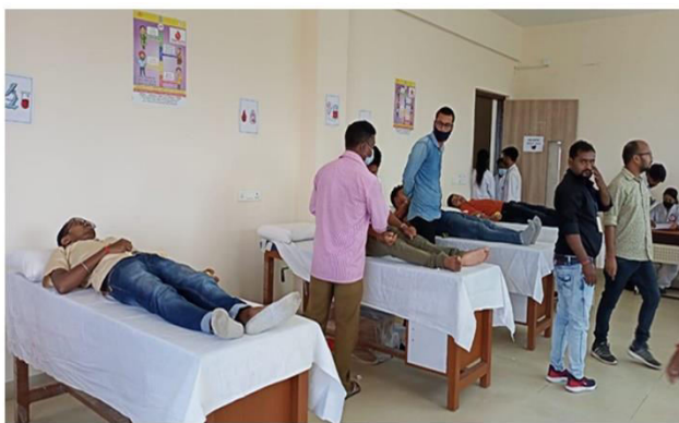
Blood donation camp in progress

A blood donation camp followed the blood donation awareness workshop. It was organized by the Health Club of Usha Martin University in collaboration with Sadar Hospital, Ranchi and Life Savers Group on 8th October.