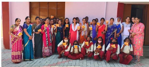
Participants with the UMU team

The Guidance and Counselling Cell at Usha Martin University organized a Menstrual Hygiene Management (MHM) program, to spread awareness around menstrual hygiene, focusing on young school going girls and local women.